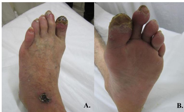
Figure 1. Ischemic ulceration of the toe and purple discoloration (A, and B)

As discussed before, the diagnosis is mainly based on the diagnostic criteria. In addition to a detailed history and physical examination, laboratory tests and imaging studies are beneficial in confirming the diagnosis, determining the severity of the disease, and excluding the differential diagnoses. Digital plethysmography and ankle-brachial index measurement are recommended. In arteriography, segmental distal occlusions, normal proximal arteries, corkscrew collaterals, and absence of arterial wall calcification are suggestive of Buerger's disease (Figure 2). Duplex ultrasound can reveal distal occlusive disease and exclude atherosclerosis. Additionally, echocardiography and abdominal ultrasonography may be done to exclude the proximal source of emboli. Several laboratory tests are also suggested, such as inflammatory markers and autoantibodies to rule out connective tissue disease, and coagulation profile for the exclusion of thrombophilia [32, 37, 38].